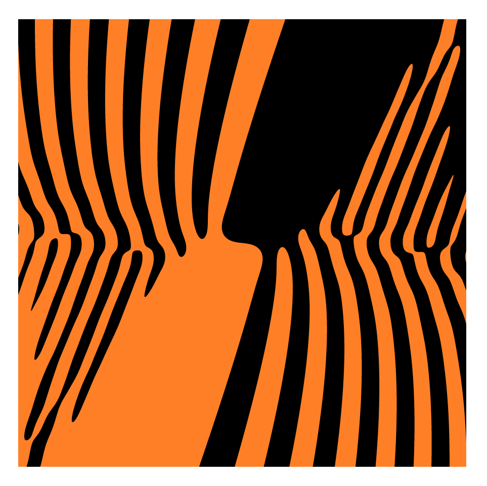
FIGURE 3. A zoomed-out view of the tiger partition: a depiction of the limiting function f_{\infty} restricted to the square [-20, 20] \times [-20, 20] \subseteq \mathbb{R}^2 , based on numerical computations.