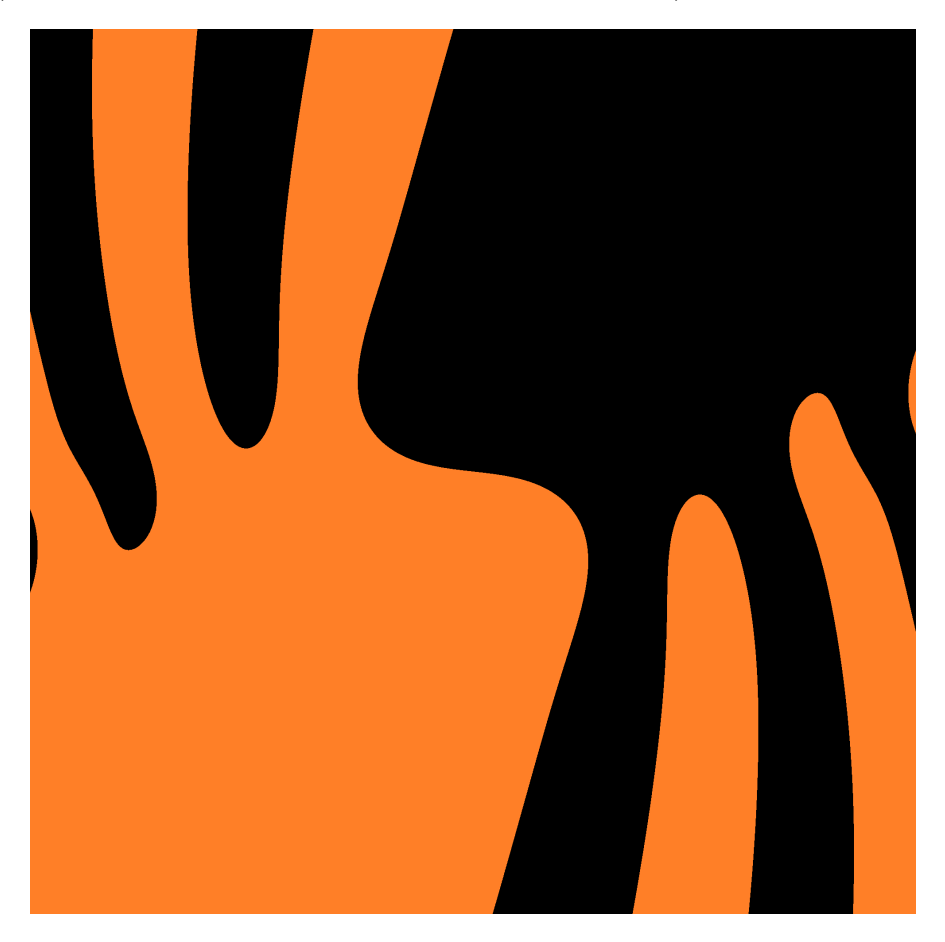
FIGURE 2. The "tiger partition": a depiction of the limiting function f_{\infty} restricted to the square [-7,7] \times [-7,7] \subseteq \mathbb{R}^2 , based on numerical computations. The two shaded regions correspond to the points where f_{\infty} takes the values +1 and -1.