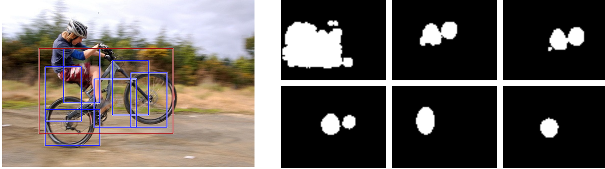
Figure 2. A sample image with a bicycle detection (left). Each image in the right shows (in white) positions where a particular part appearance model was evaluated at the scale of the bicycle detection. The images are shown in “cascade order” from left to right and top to bottom. The image for the root part, which was evaluated first, is not shown because its appearance model is evaluated at all locations. After evaluating the first non-root part, nearly all locations were pruned by the cascade.